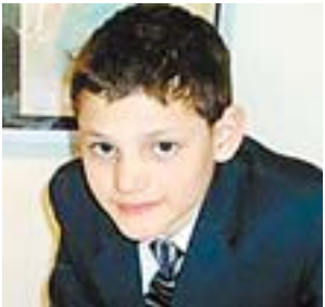
COMMUNITY SPIRIT Young autistic author inspires and entertains with imaginative debut book