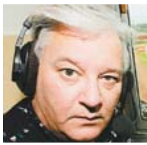
SPORTUNLIMITED Legendary Edmonton baseball broadcaster gets his due on the basketball court